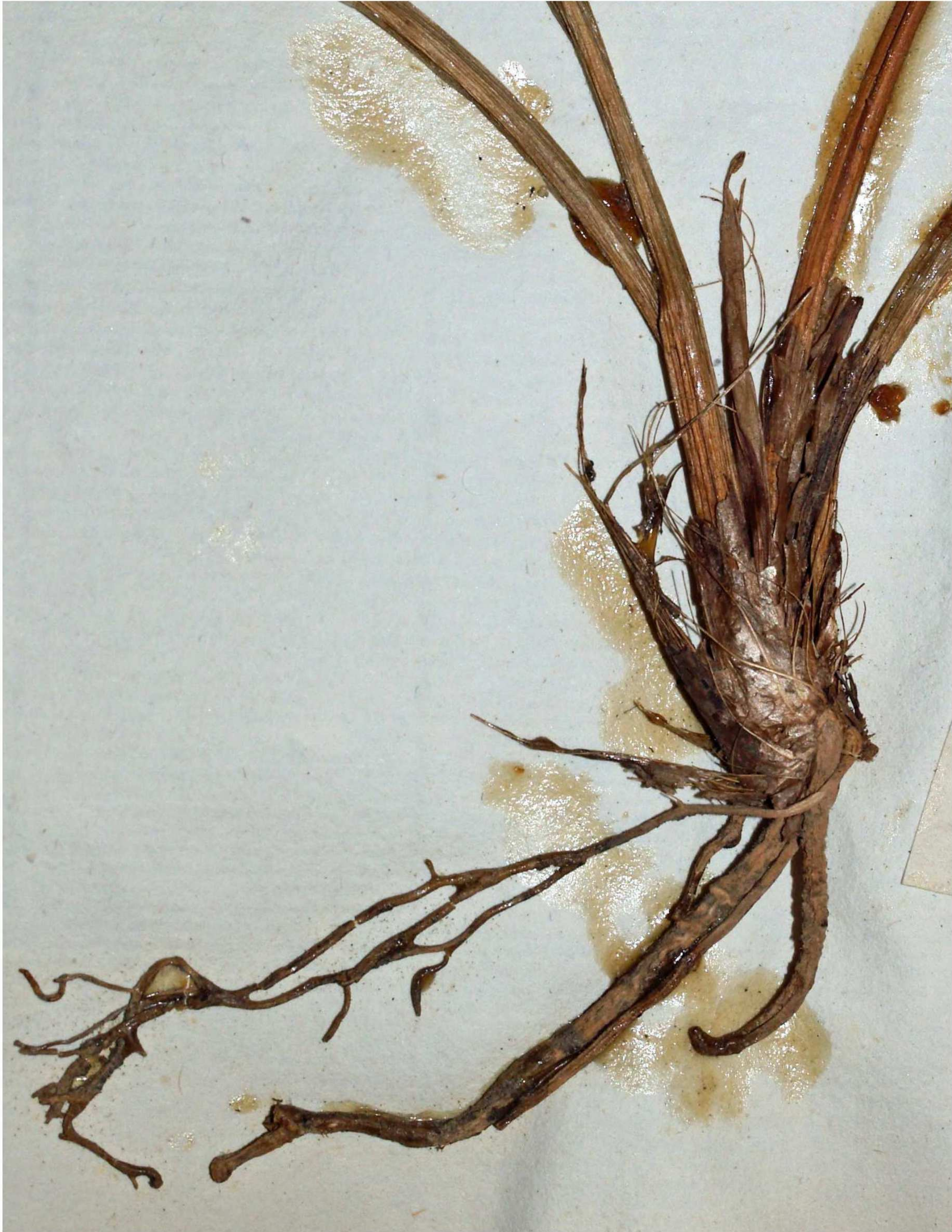
Figure 2. Detail from holotype of Convallaria spicata Thunb. at UPS. Structures at the base are fibrous roots, the thicker ones contractile.